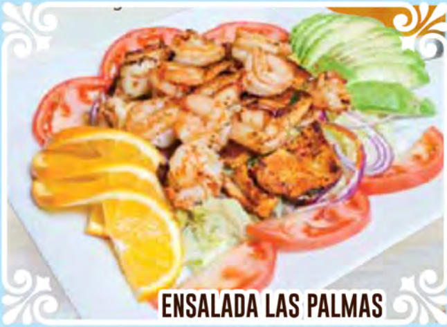
ENSALADA LAS PALMAS