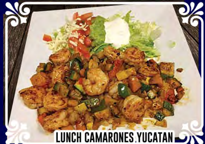
LUNCH CAMARONES YUCATAN

Fried pork served with rice, beans and guacomole salad. $14.99