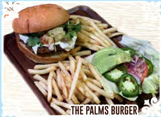
THE PALMS BURGER

Charbroiled Mexican chorizo, queso Oaxaca, pico de gallo, pineapple, lettuce, tomato, mayo, jalapenos and avocado. Served with French fries. $16.99