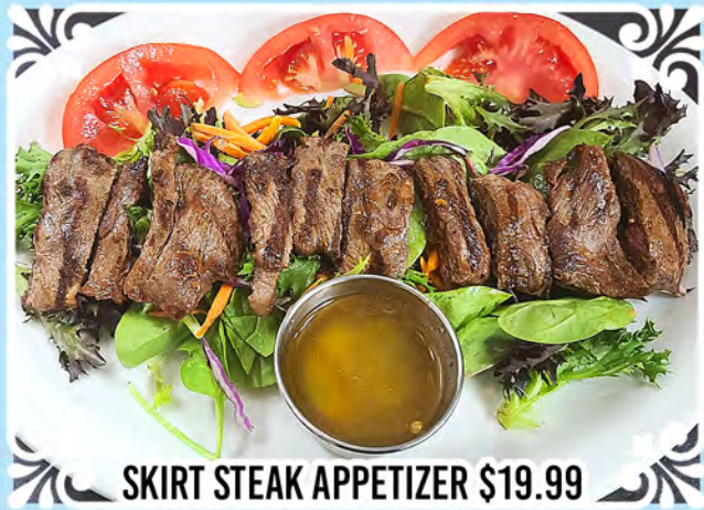
SKIRT STEAK APPETIZER $19.99