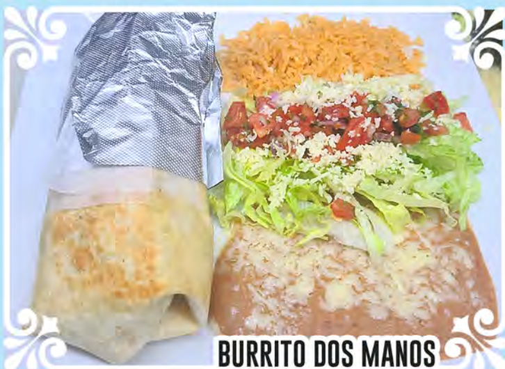
BURRITO DOS MANOS