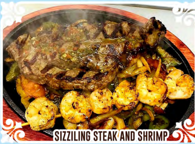
SIZZILING STEAK AND SHRIMP