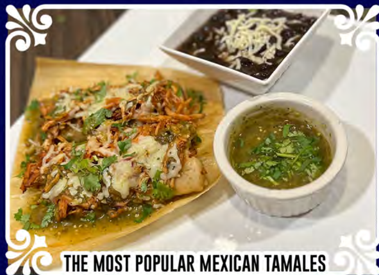
THE MOST POPULAR MEXICAN TAMALES