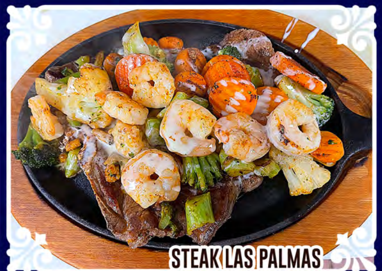
STEAK LAS PALMAS