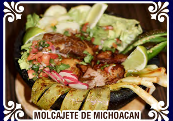
MOLCAJETE DE MICHOACAN