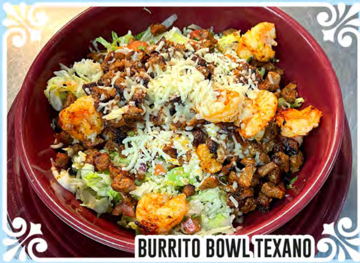
BURRITO BOWL TEXANO

Bean enchilada, cheese enchilada and potato enchilada topped with nacho cheese sauce, lettuce, guacamole, sour cream. Served with choice of beans or rice. $13.99