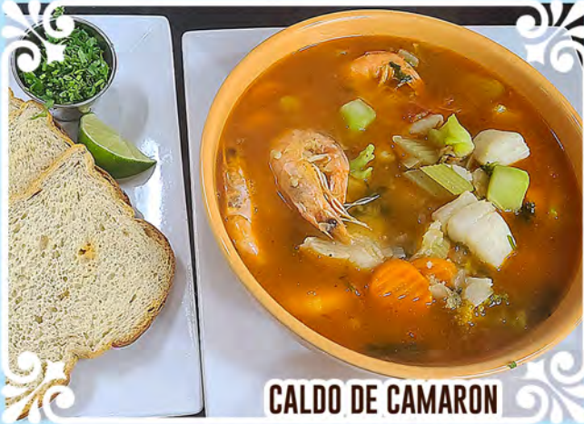
CALDO DE CAMARON