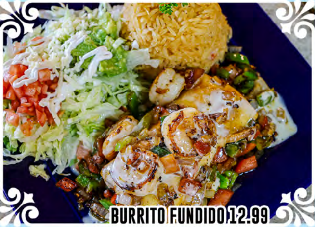
BURRITO FUNDIDO 12.99