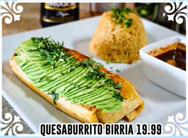
QUESABURRITO BIRRIA 19.99