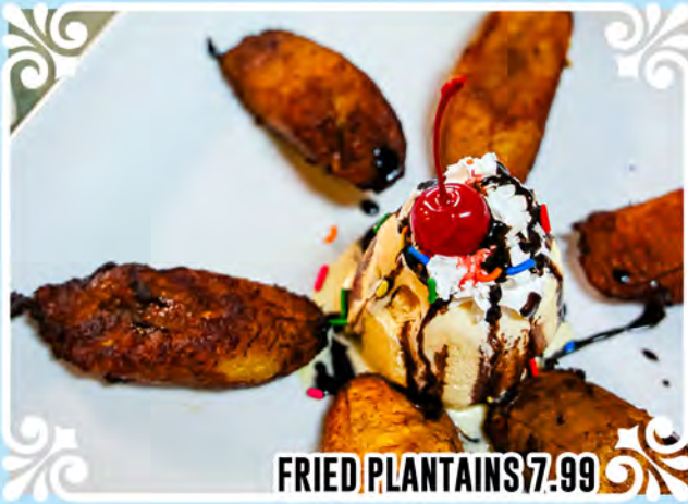
FRIED PLANTAINS $7.99