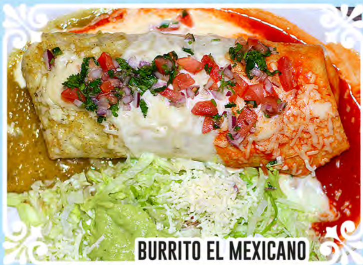
BURRITO EL MEXICANO

Steak, chicken & shrimp, choice of shredded lettuce or spring mix lettuce with guacamole, shredded cheese and sour cream. $20.99