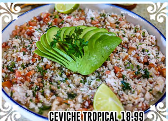
CEVICHE TROPICAL 18.99