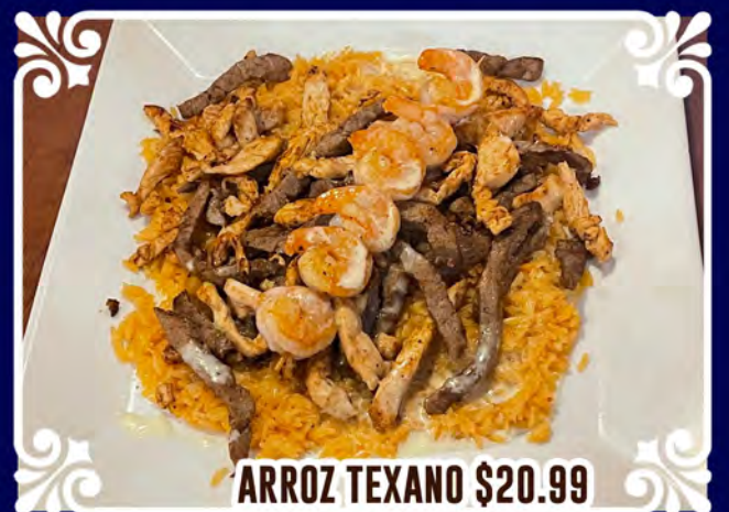
ARROZ TEXANO $20.99