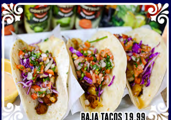
BAJA TACOS 19.99