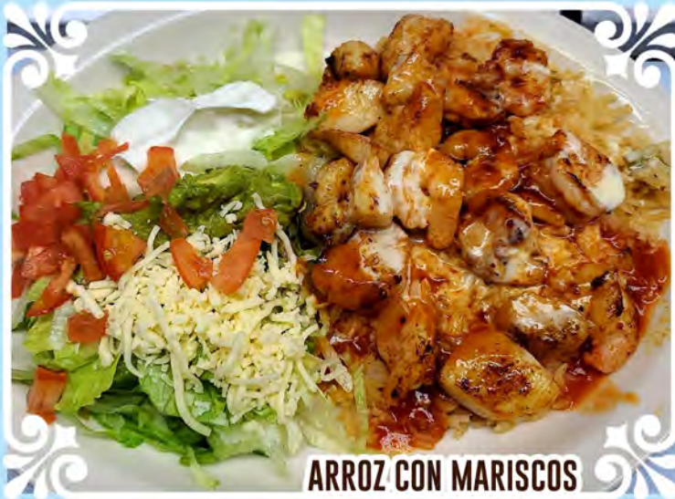
ARROZ CON MARISCOS