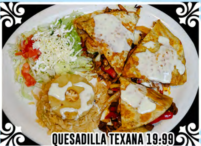
QUESADILLA TEXANA 19.99