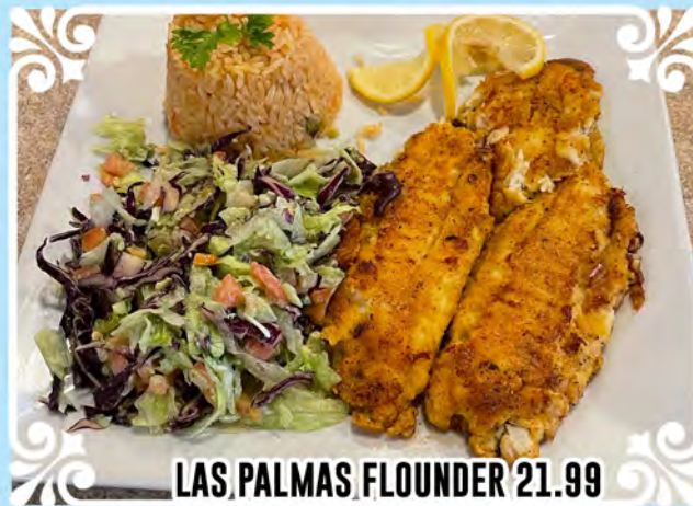
LAS PALMAS FLOUNDER 21.99

Breaded or grilled, served with rice and guacamole salad.