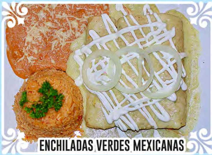
ENCHILADAS VERDES MEXICANAS