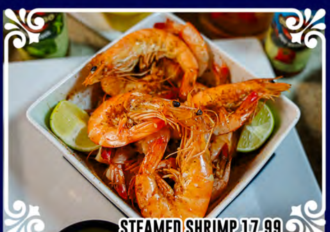
STEAMED SHRIMP 17.99