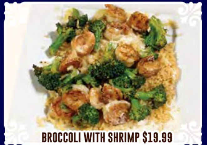
BROCCOLI WITH SHRIMP $19.99