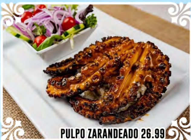
PULPO ZARANDEADO 26.99