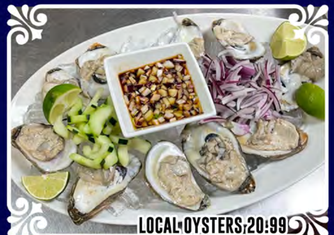
LOCAL OYSTERS $20.99