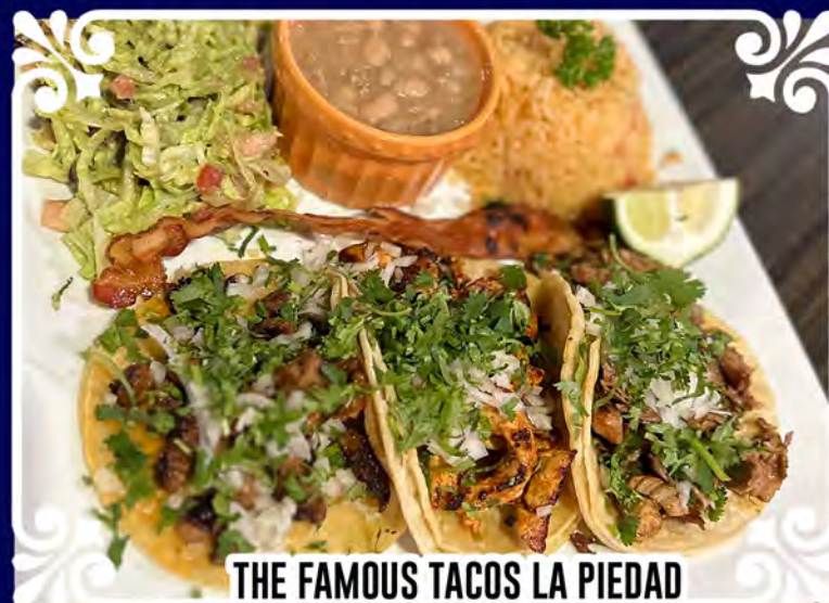
THE FAMOUS TACOS LA PIEDAD