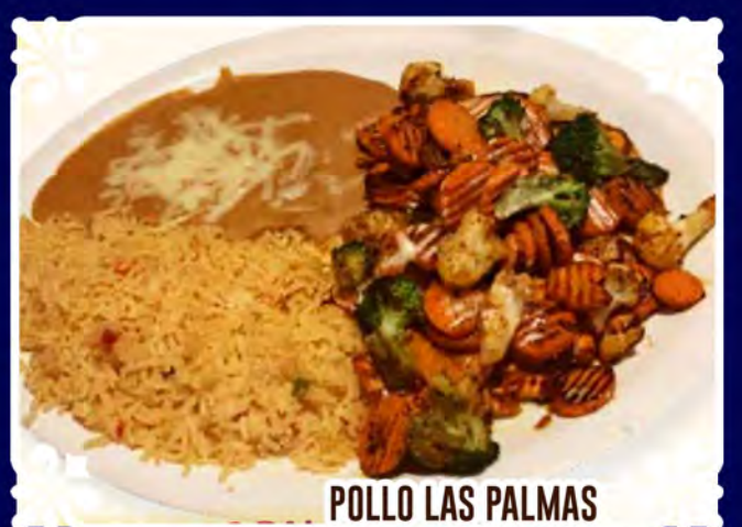
POLLO LAS PALMAS