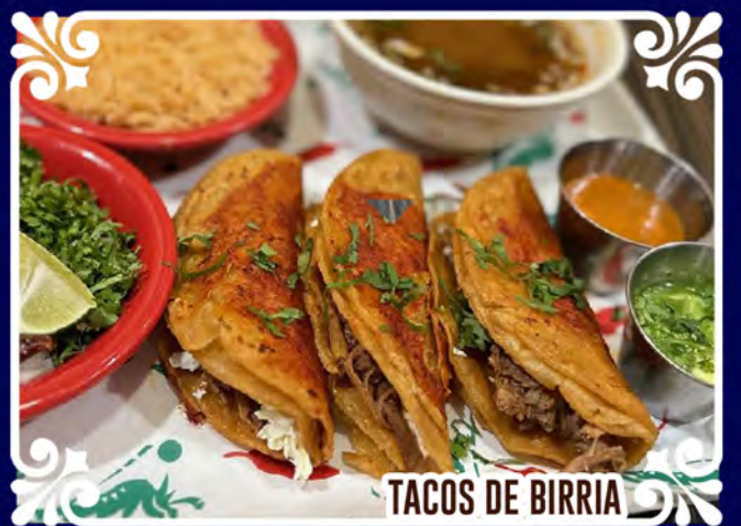
TACOS DE BIRRIA