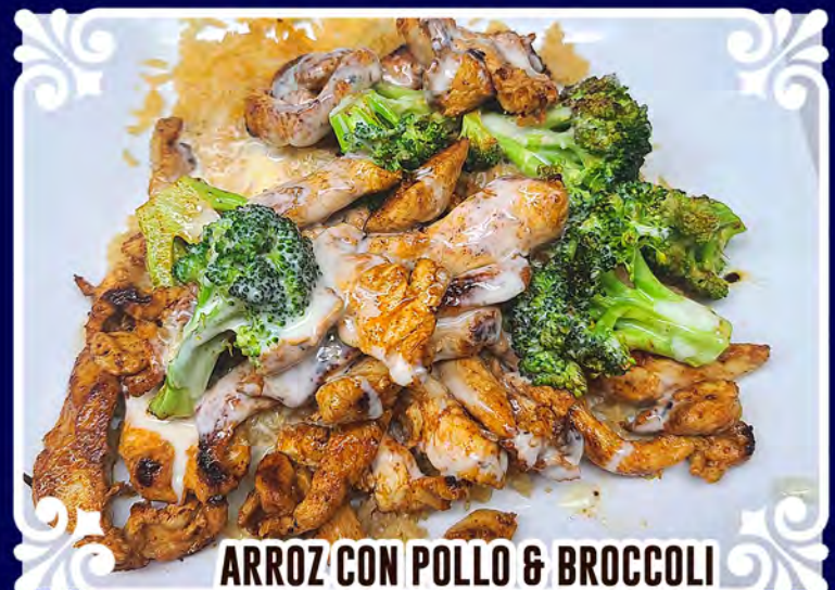
ARROZ CON POLLO & BROCCOLI

* NOTICE: MAY BE COOKED TO ORDER. CONSUMING RAW OR UNDERCOOKED MEATS, POULTRY, SEAFOOD, SHELLFISH OR EGGS MAY INCREASE YOUR RISK OF FOODBORNE ILLNESS, ESPECIALLY IF YOU HAVE CERTAIN MEDICAL CONDITIONS.