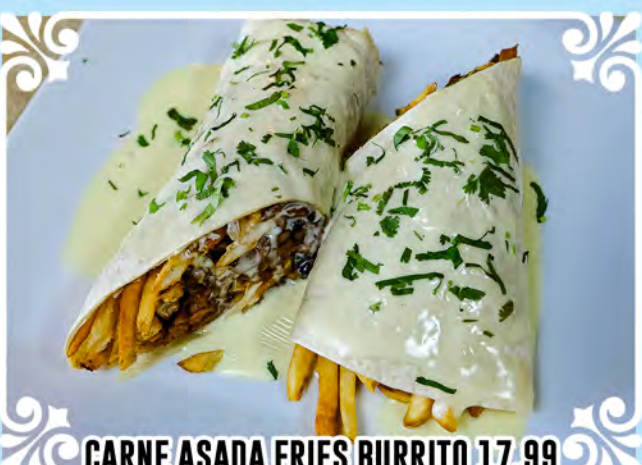
CARNE ASADA FRIES BURRITO 17.99