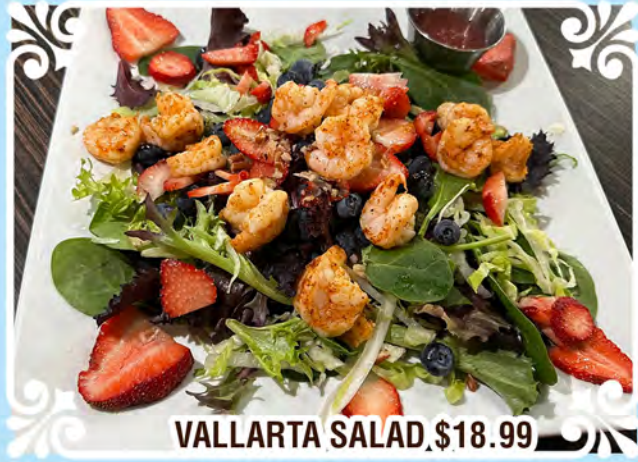
VALLARTA SALAD $18.99