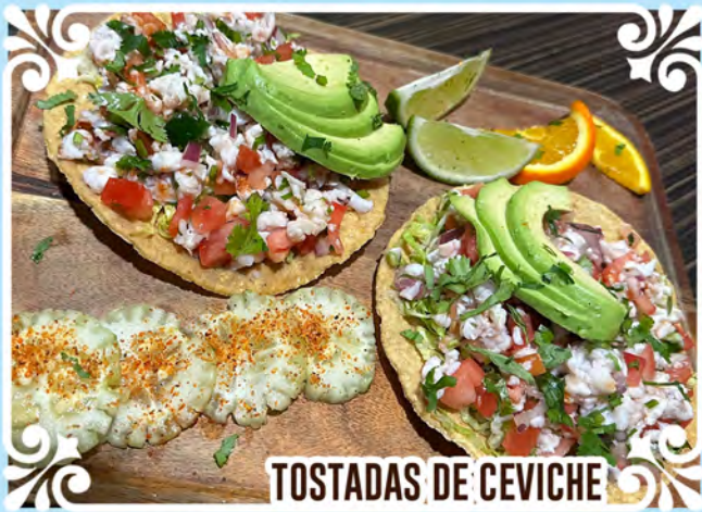
TOSTADAS DE CEVICHE