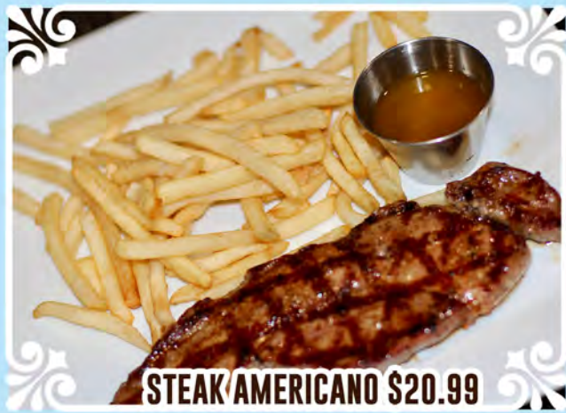
STEAK AMERICANO $20.99