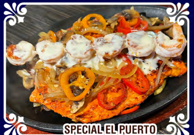
SPECIAL EL PUERTO