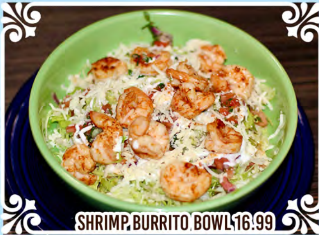
SHRIMP BURRITO BOWL 16.99