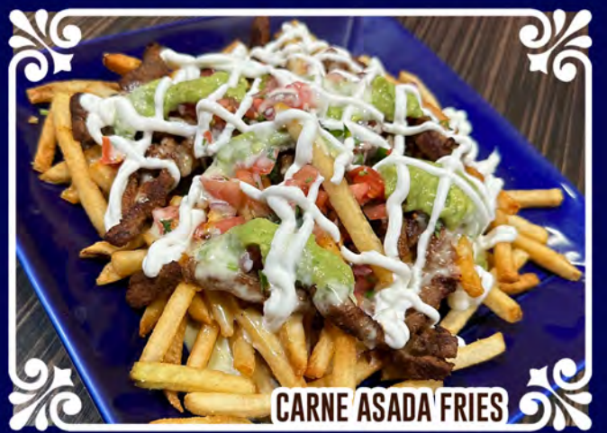
CARNE ASADA FRIES