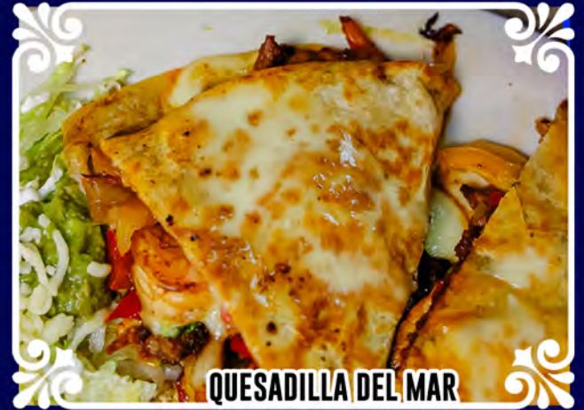
QUESADILLA DEL MAR