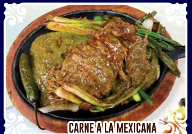
CARNE A LA MEXICANA

Carne asada served with rice, pinto beans and salad. $23.99