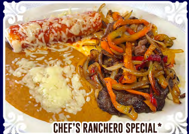
CHEF'S RANCHERO SPECIAL*