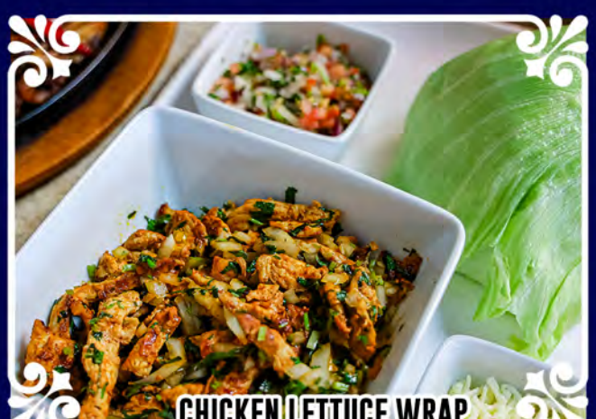
CHICKEN LETTUCE WRAP