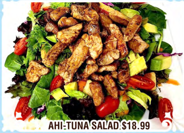
AHI-TUNA SALAD $18.99