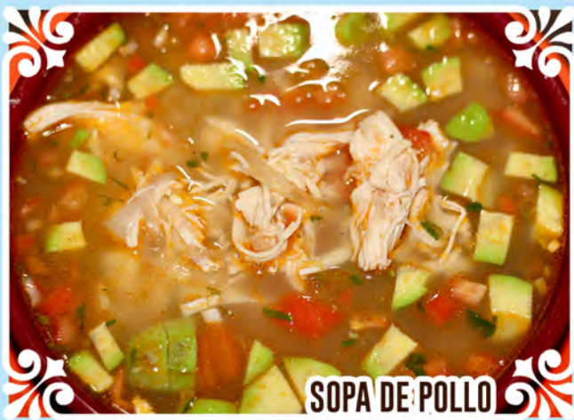
SOPA DE POLLO