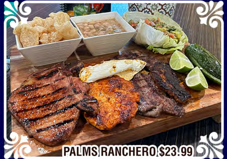
PALMS RANCHERO $23.99